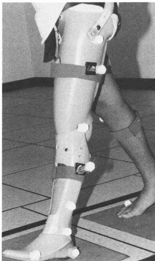
Figure 1. Completed experimental prosthesis; shown during testing in the Kinesiology laboratory.

The completed prosthesis is shown in Figure 1. With the moveable mass placed distally, the shank had a center of mass positioned similarly to the patient's original shank. Shifting the mass proximally caused the center of mass to move proximally by 13 centimeters. To deter-